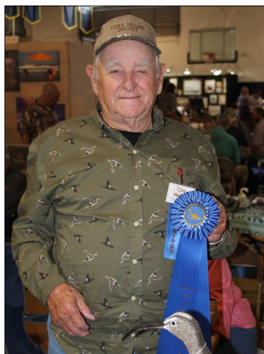
Cork McGee People's Choice Award for Best Carver