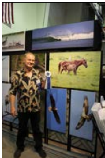
Bob Schamerhorn Best Photograph of Chincoteague/Assateague